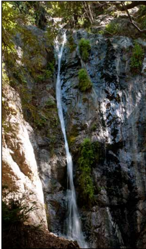
Pfeiffer Falls, Pfeiffer Big Sur State Park

Adjacent to the softball field at Pfeiffer Big Sur State Park is one of Big Sur's largest redwood trees. The size of this ancient tree, known locally as the "Colonial Tree," is deceiving — due to lightning strikes, this majestic specimen's top has been severed.