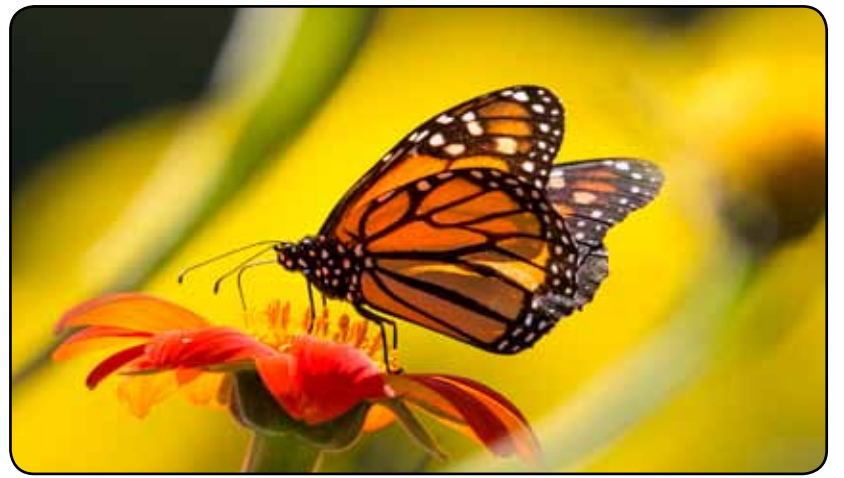
Monarch butterflies migrate to Big Sur annually.

Evenings offer the opportunity to dine in restaurants from fanciful to exquisite. Relax in lodging that ranges from rustic to ultra-luxurious. Camp out in the many well equipped campgrounds. Luxuriate at health spas. And of course, one of the favorite ways to pass the time in Big Sur is to simply Do Nothing .