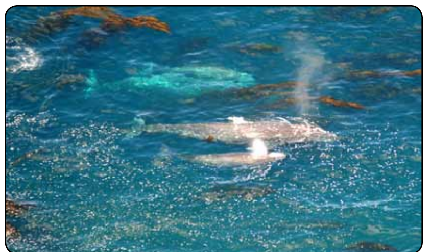
Gray whales migrating along the Big Sur coastline