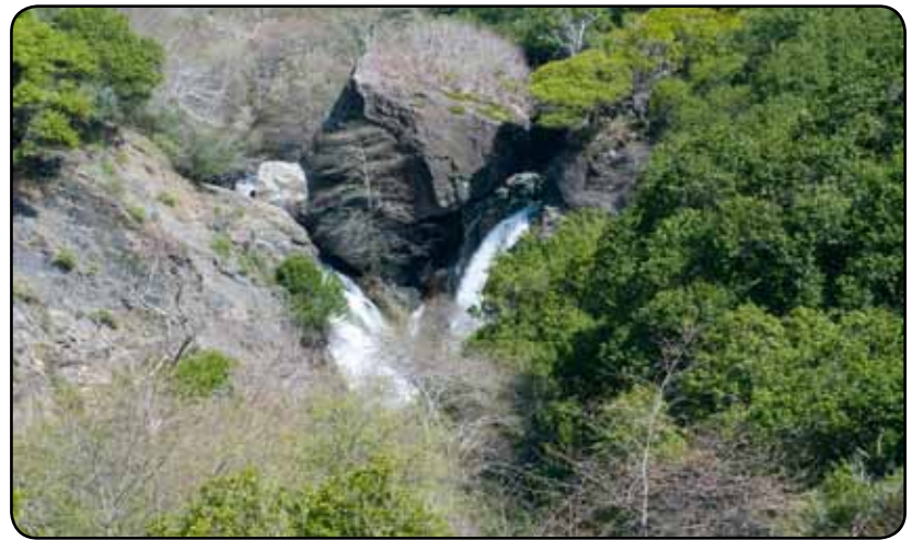
Salmon Creek Falls