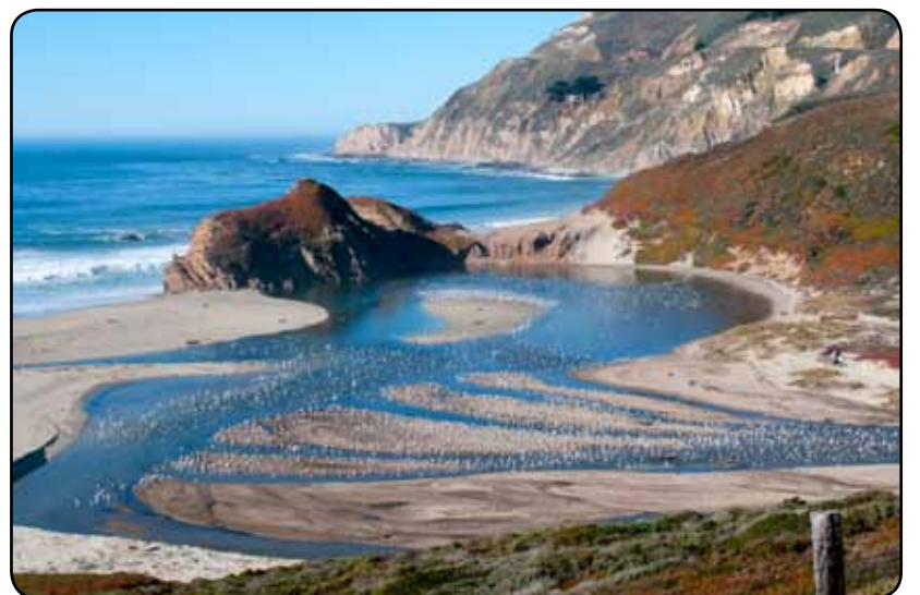
Little Sur Rivermouth